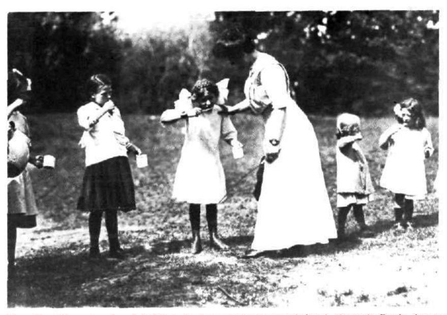
Teaching Toronto school children hygiene at the Forest School, Victoria Park, August 1913. This special summer program in an outdoor school evolved from health instruction in the regular program.