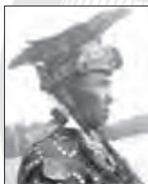
Willie Seaweed (Siwiti), 1951.