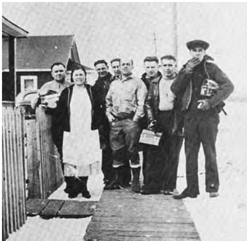
A Coniston Ukrainian boarding house operator and her Ukrainian boarders, circa 1930.

were cunning or abusive; memories of boarding houses as sites of pleasure alongside those that spoke to danger.