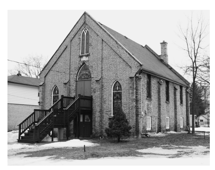
Beth Emanuel Church, London, Ontario, 2011, founded 1856 and a centre of African Canadian activity.

individuals were working as farmers.<sup>65</sup> Overall, the African American male labour force was less concentrated in 1901, but there was still a tendency for the men to cluster in the same kinds of jobs they had held in the past. Over half of the African-origin male population was employed in a small number of jobs. In 1901, as in 1881, there was little information available on employers, but the evidence shows that very few employed more than one male of colour – the only exceptions being a few barbershops, a furniture company, and possibly George Kelly and Company, cigar makers.<sup>66</sup>