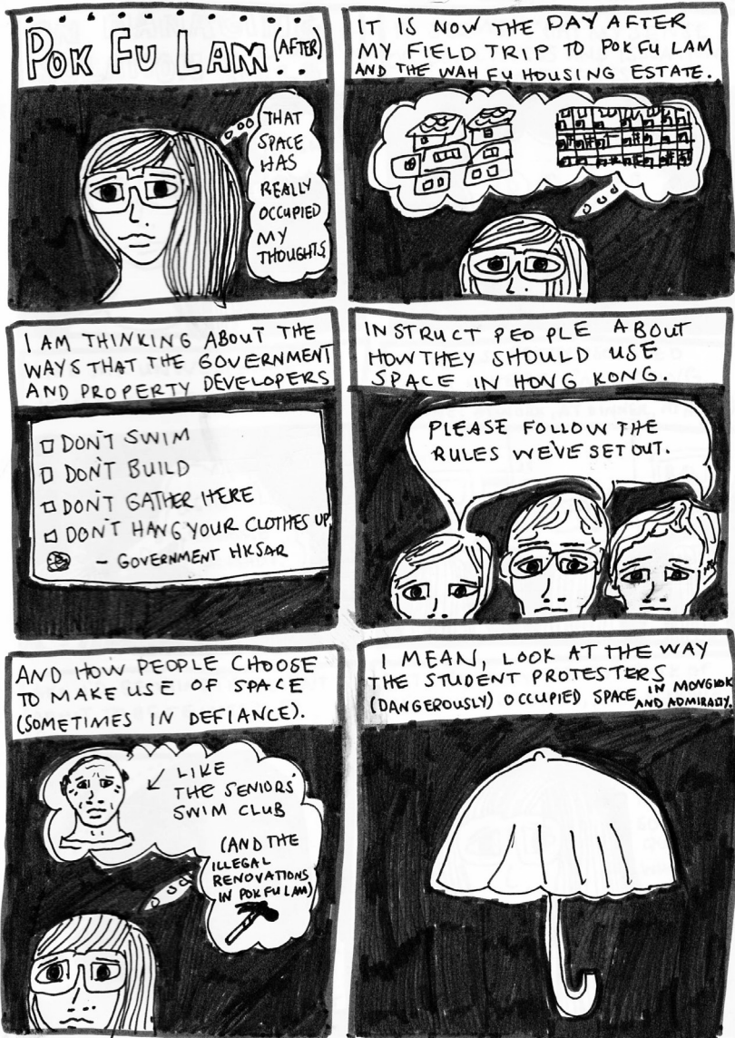
FIGURE 3. Pok Fu Lam (after) (Burkholder, 2015b)

In the evening, generally after dinner, I would sit in a public space and add the drawings to my writing. The following morning, I would add the definition and shading to my drawings, photograph each panel, and upload it to my blog.