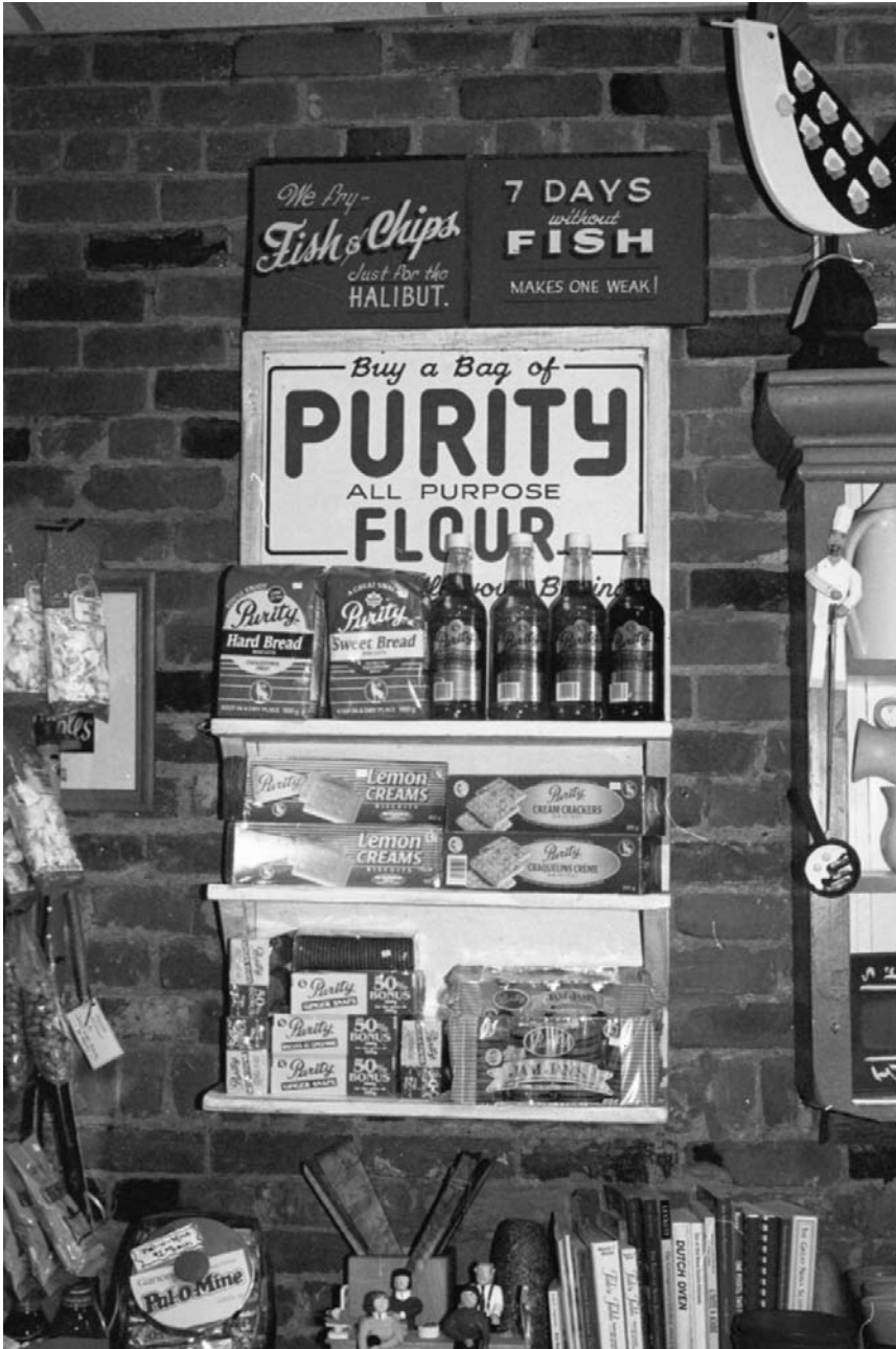
Figure 5. Purity Products on display in Downeast Crafts, 508 Bathurst Street, Toronto, October 2002.