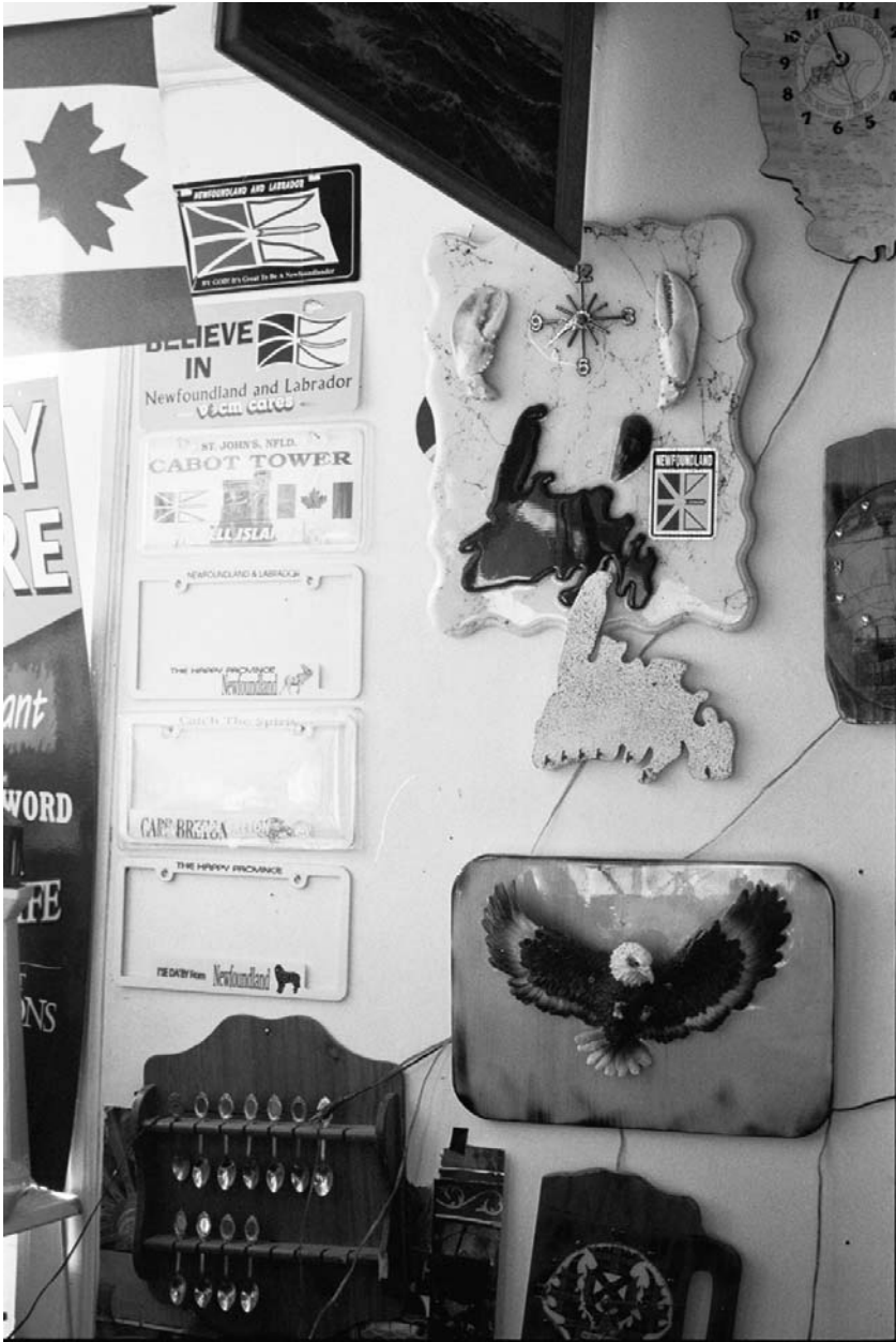
Figure 3. Newfoundland license plate holders, wall clocks, and plaques on display at Claremichael's Maritime and General Shoppe, 1258 The Queensway, Toronto, November 2002.