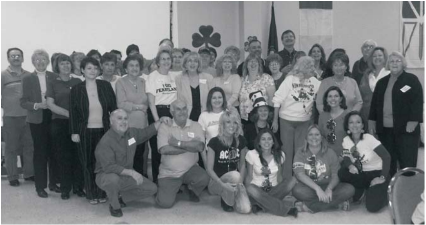
Figure 2. Newfoundland-born celebrants at the Newfoundland-St. Patrick's Day Party, Virginia Beach, March 2006.