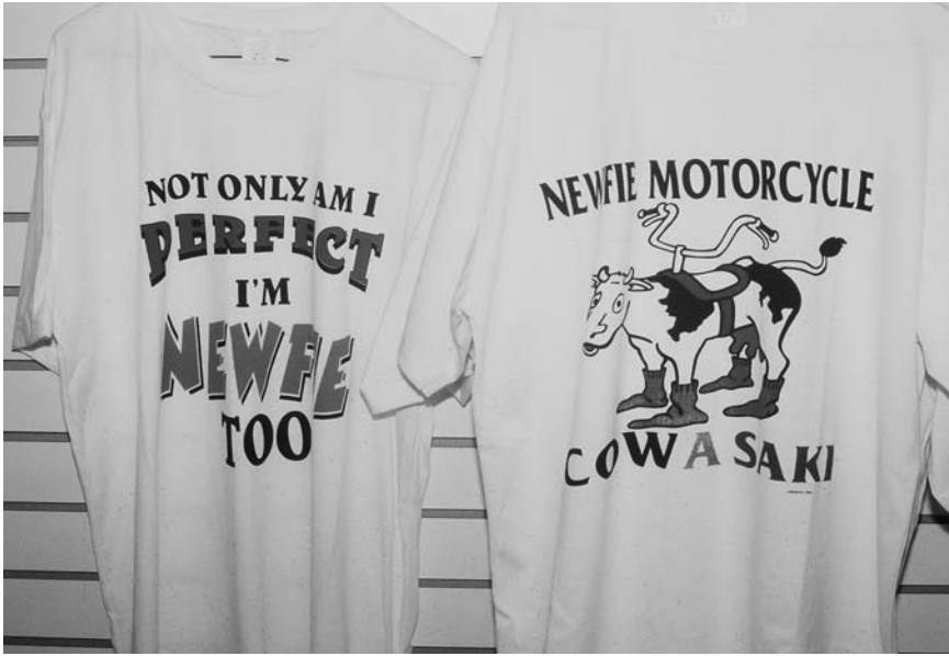
Figure 4. Newfoundland T-Shirts on display at Newfoundland Necessities, 746 Markham Road, Scarborough, November 2002.

symbiotic weakening. As argued by Gerald Pocius in his comparison of vernacular architecture and professional wrestling in Newfoundland, authenticity is not important in the lived realities of everyday life. As with the traditional songs in the canon, these material examples of kitsch are supposed to evoke a sense of nostalgia, and subsequently support the development of communal identity.