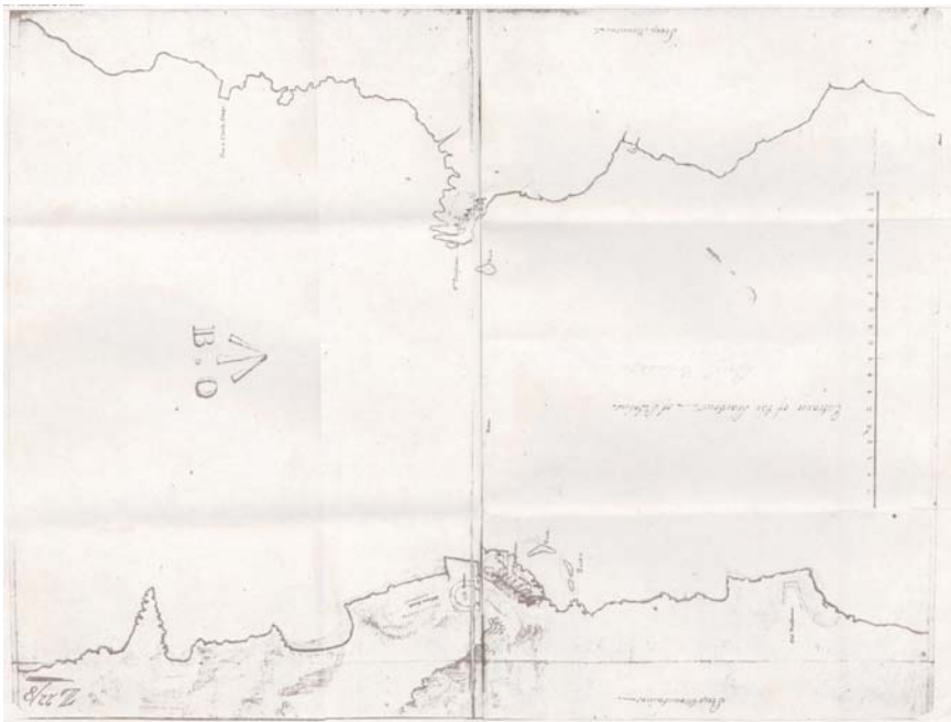
Figure 3. Brigadier Richards' map "Entrance of the Harbour of St. John's," circa 1700. Showing the location of the North Platform, South Platform and Old Platform in the Narrows.

Closely related to the Beckman map is Brigadier Richards' map "Entrance of the Harbour of St. John's" (Figure 3). The outline of the Narrows shown on the Richards map bears such a strong resemblance to the Beckman map that one was almost certainly copied from the other. Indeed, there can be little doubt but that the latter was a plan used by Richards during his work on the harbour's defences (Rich-