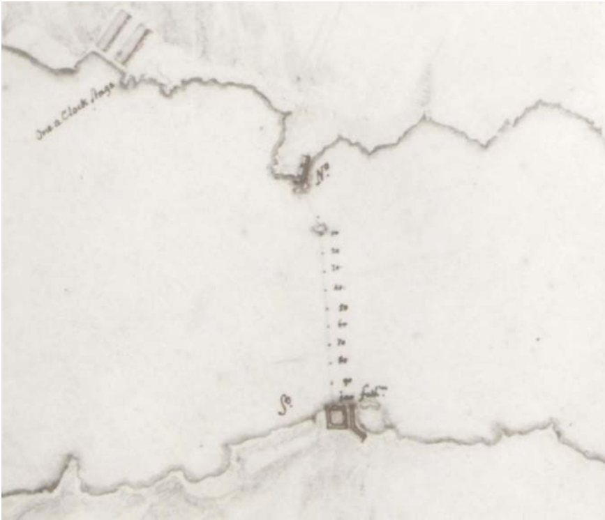
Figure 2. Detail from Martin Beckman's 1698 map "St. John's Harbour and K. Williams Fort in Newfoundland" showing the North and South Forts in the Narrows and the cable stretched between them.

South Fort had been moved farther west and was now at Anchor Point. This may have been done to guard both ends of the cable stretching across the Narrows from Chain Rock. The North Fort is depicted as a main defensive wall stretching along the eastern side of the point with several short interior walls extending northwest from, and perpendicular to, the main wall. The South Fort is more elaborate, consisting of a square fortification located on Anchor Point and an outer defensive wall running parallel to the fortification's east wall then turning southeast and extending for some distance in that direction. One A' Clock is clearly shown on this map but, again, it is not fortified. Instead, it is represented as One A' Clock Stage and two large rectangular structures are shown just west of it.