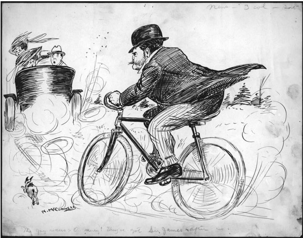
This 1905 Toronto News drawing, entitled 'The Joy Riders,' shows an aggressive James Whitney pursuing a speeding vehicle. The caption reads: "Oh mercy! They've got Sir James after us."