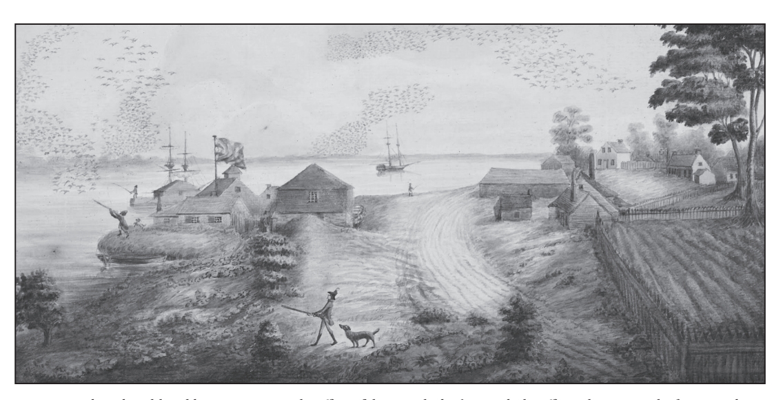
Figure 1: Edward Walsh, Old Fort Erie. Note the officers fishing in the background, the officers shooting in the foreground, and the vegetable garden to the right. (Royal Ontario Museum).

cultivate the necessary vegetables, which by any other means they would not be able to procure."<sup>27</sup> Similarly, Brock noted how, in 1803, soldiers at Fort George were employed to make a vegetable garden.<sup>28</sup> One osteoarchaeological study reiterates that British soldiers did, in fact, consume vegetables.<sup>29</sup> Vegetables were clearly consumed by British soldiers in Niagara and perhaps beyond, but what they ate specifically is much more un-