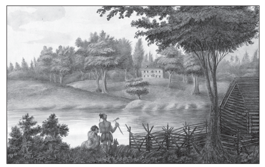
Figure 4: Edward Walsh, The House of Capt. Brant. Here, Joseph Brant hosted British officers to exquisite dinners that deepened social relations between the Haudenosaunee of the Grand River and the British.

Byfield after the disastrous 1813 Battle of the Thames, for example: