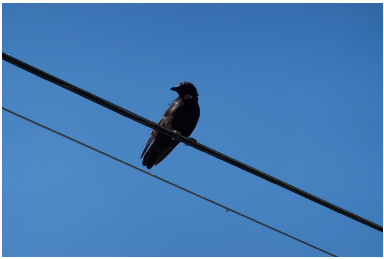
An urban crow. Regina, Saskatchewan, June 2020.