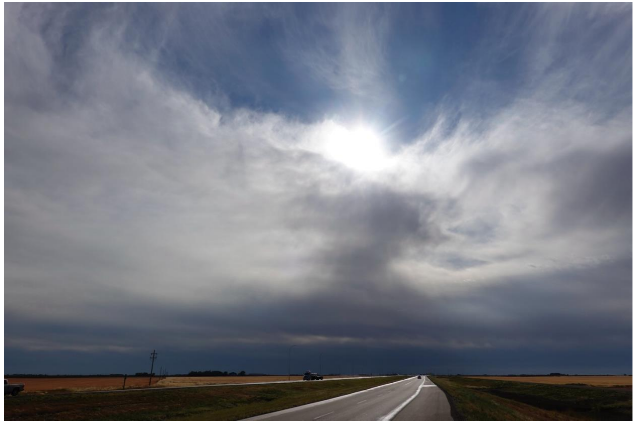
After the rain. Regina Bypass, south of Regina, Saskatchewan, September 2020.