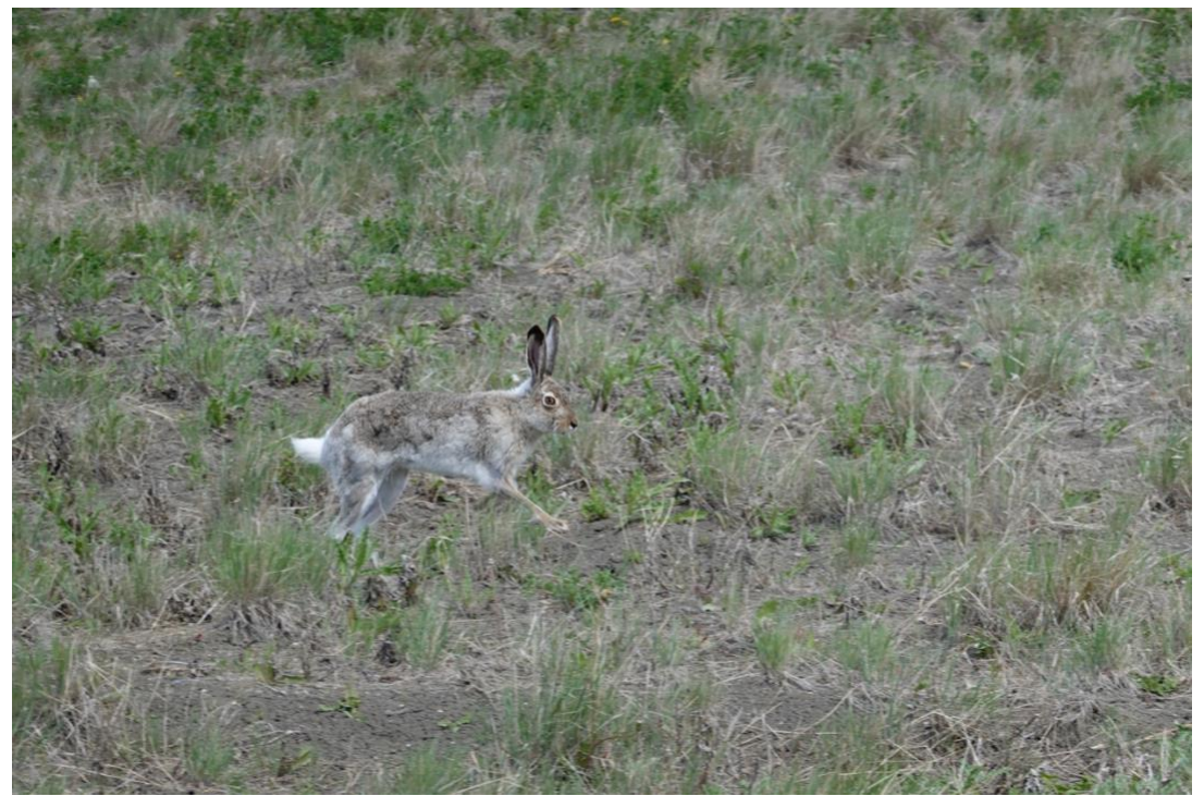
A city rabbit in a vacant suburban lot. Regina, Saskatchewan, June 2020.