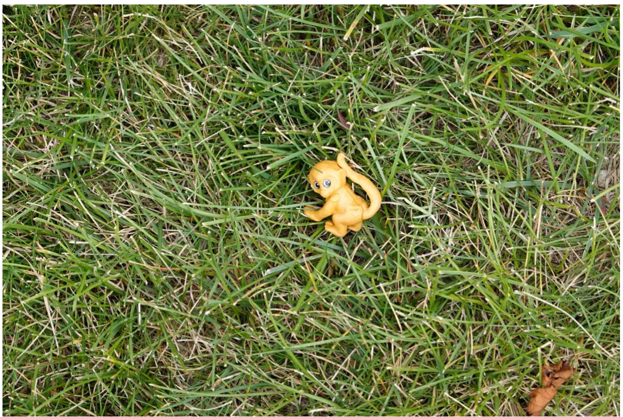
A lost toy on a front lawn. Regina, Saskatchewan, July 2020.