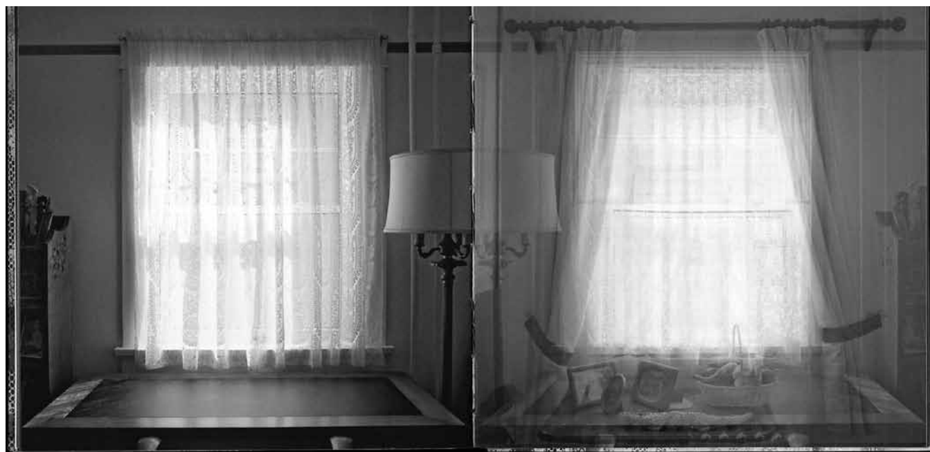
Page spread from Glaze: Veiled , 2013. Inkjet printed, 21 x 41.9 cm.

Corner offers an interplay between the architecture of the book and of the imagery. Photographs of entrances and exits, illuminated by interior and exterior light, flow over the pages to meet at the gutter. Each folded page spread cradles an unoccupied space charged with implied conversations between absent inhabitants.