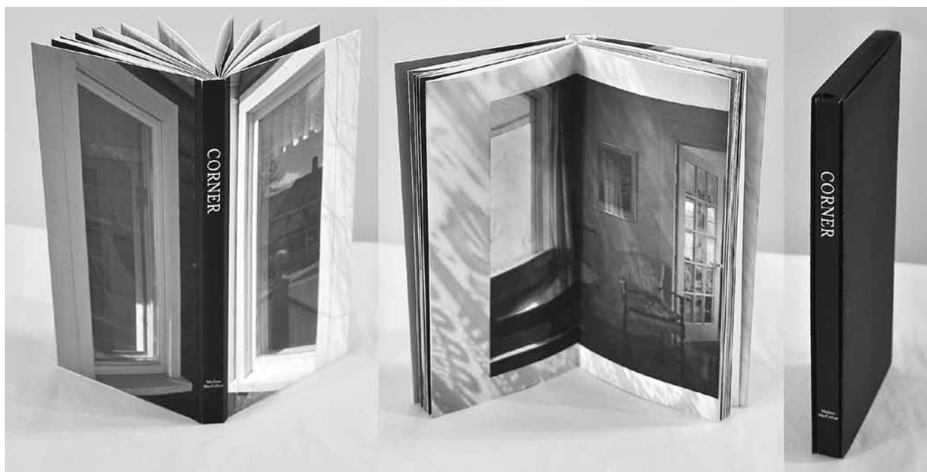
ABOVE: Corner , 2013. Hand-bound codex style bookwork with slipcase, book block printed in photogravure on paper; covers inkjet-printed on coated tyvek, 25.1 x 12.7 x 1.9 cm (closed).

Glaze: Reveal and Veiled present twenty-four images of Townsite windows grouped and layered into two distinct sequences. The structure is a dos à dos (two books bound together, readable from opposite directions), and each side offers a different visual metaphor for memory. Reveal creates intermingled memories that slowly unpeel into a singular image, whereas Veiled presents layered spaces suggestive of blurred recollections.