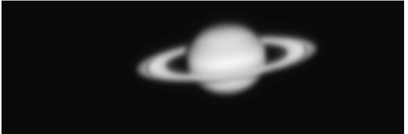
Imaging Saturn 2013. 2012-05-11T22:35:11-04, 22 frames stacked from 29 seconds of video.

I have so far created a series of twenty-nine charcoal drawings that depict three views of Saturn on the day of its opposition—that moment each year when the planet is opposite Earth from the Sun—throughout its orbital period. Creating these drawings was both a research and a creation activity insofar as the drawings are finished and exhibited works of art. Making the drawings helped me to visualize and understand relevant planetary and galactic motions as seen from Earth, along with what the planet would look like each year.