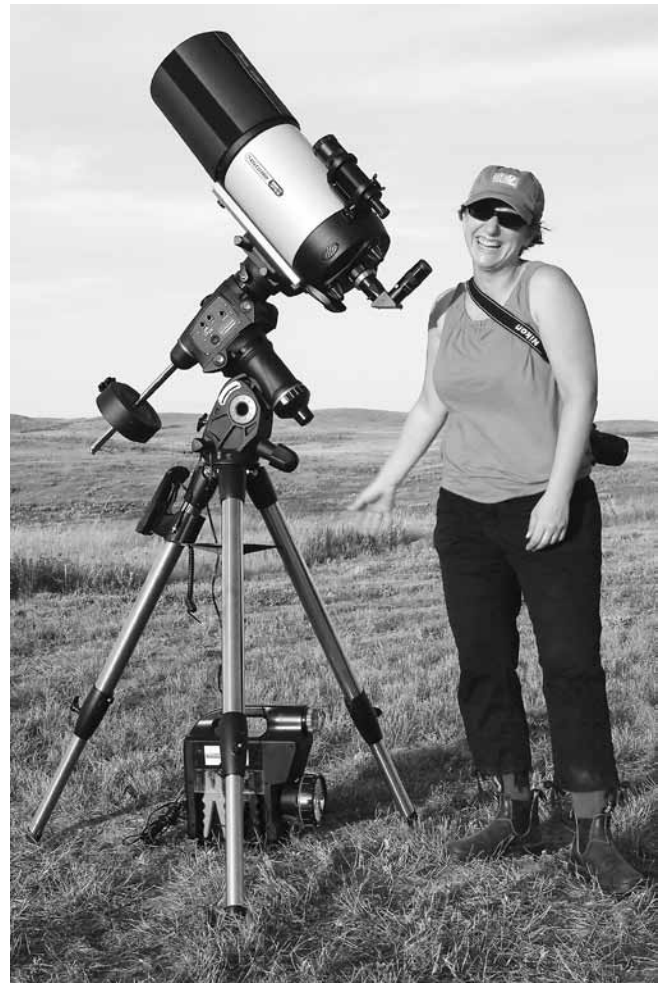
Labour Day Weekend camping, Grasslands National Park (West Block), Saskatchewan, with 8" scope. 30 August 2013.

Aside from the obvious learning curve related to the workings of the solar system and universe, astrophotography is a highly specialized sub-discipline with a unique set of tools and techniques. These include operating a telescope that requires precise physical orientation to the cosmos to account for Earth's rotation, and acquiring images through video capture for processing multiple still frames into image "stacks" that provide more detailed still images than our "blurry" atmosphere would otherwise permit. I have become an active member of the Royal Astronomical Society of Canada (Regina and Toronto centres) to share and receive mentorship and knowledge, and to investigate intersections of creative practices and sciences, highlighting how common interests can be used to bridge disciplinary divides.