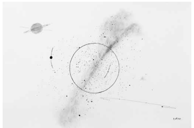
Imaging Saturn (Oppositions 2024). Charcoal drawing on Arches 88, 38.1x76.2 cm. 2013.