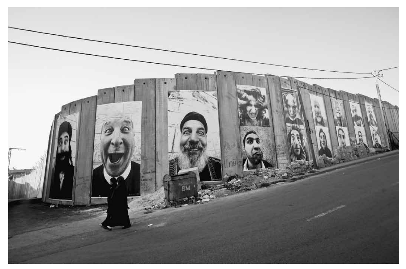
Figure I. JR, 28 Millimeters, Face2Face, Separation Wall, Palestinian Side in Bethlehem, March 2007.

developments in participatory art, visual research, and social media. Many leading scholars in participatory and collective art practices have related the rise of cultures of participation to the spread of global neoliberalism.<sup>19</sup> For example, art scholar Grant Kester suggests that we consider the recent surge of art practices that visualize social networks or produce new forms of social interactions in terms of what it reveals about our current political moment,<sup>20</sup> noting that the past two decades have not only seen the "rise of a powerful neoliberal economic order," but also a reinvigorated sense of "political renewal" in communities worldwide.<sup>21</sup> These are the conditions in which Inside Out flourishes.