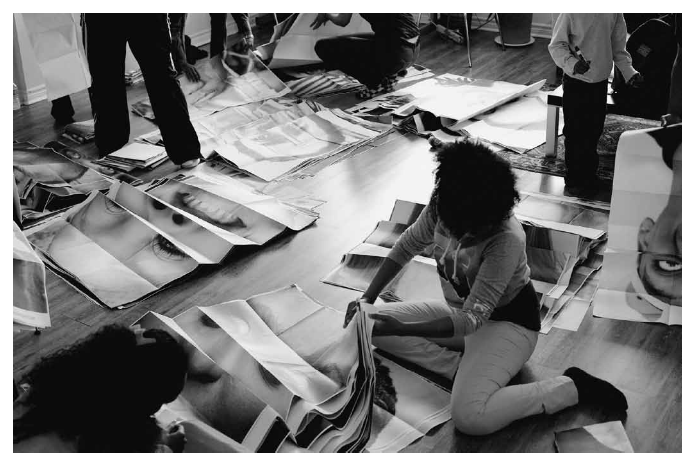
Figure 2. Photo documentation of the Toronto Inside Out group action by Manifesto Festival of Community and Culture, September 2011. Toronto, Ontario (Photo: Anna Keenan, Manifesto Festival, 2011).

mounted in their selected sites (fig. 2).<sup>25</sup> At this stage the groups have the task of mounting the posters with or without consent. Groups hoping to paste the posters with consent need to apply for permits in advance or otherwise negotiate with landholders, such as business owners, institutions, or urban developers, to obtain the rights to use the selected space. In addition, many groups plan celebratory events and engage with the press as a way to further spread the message of their project. Thus, there are wide-ranging opportunities for participation within an In side Out group action, from having one's photograph taken to rather sophisticated, professional tasks, including the management of the action's execution.