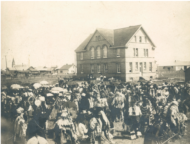
Figure 3. Sir Wilfred Laurier's visit to Fort MacLeod, with Court House in the Background, c. 1913. Reproduced with the permission of the Fort Macleod Historical Association FMP.80.6.3.