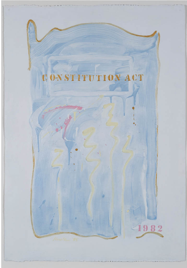
Figure 1. Robert Houle, Constitution Act, 1985, acrylic on paper, 106 x 75 cm. Collection of the Aboriginal Art Centre. Reproduced with the permission of the artist and Indigenous and Northern Affairs Canada.