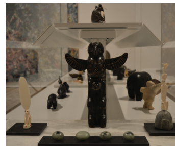
Installation shot, Canadian and Indigenous Art: From Time Immemorial to 1967, 2017, National Gallery of Canada.

For Canadians and visitors alike, NGC plays a role in defining the officially embraced national story of Canada. Bringing Inuit art out of the basement thus represents a step towards challenging settler notions