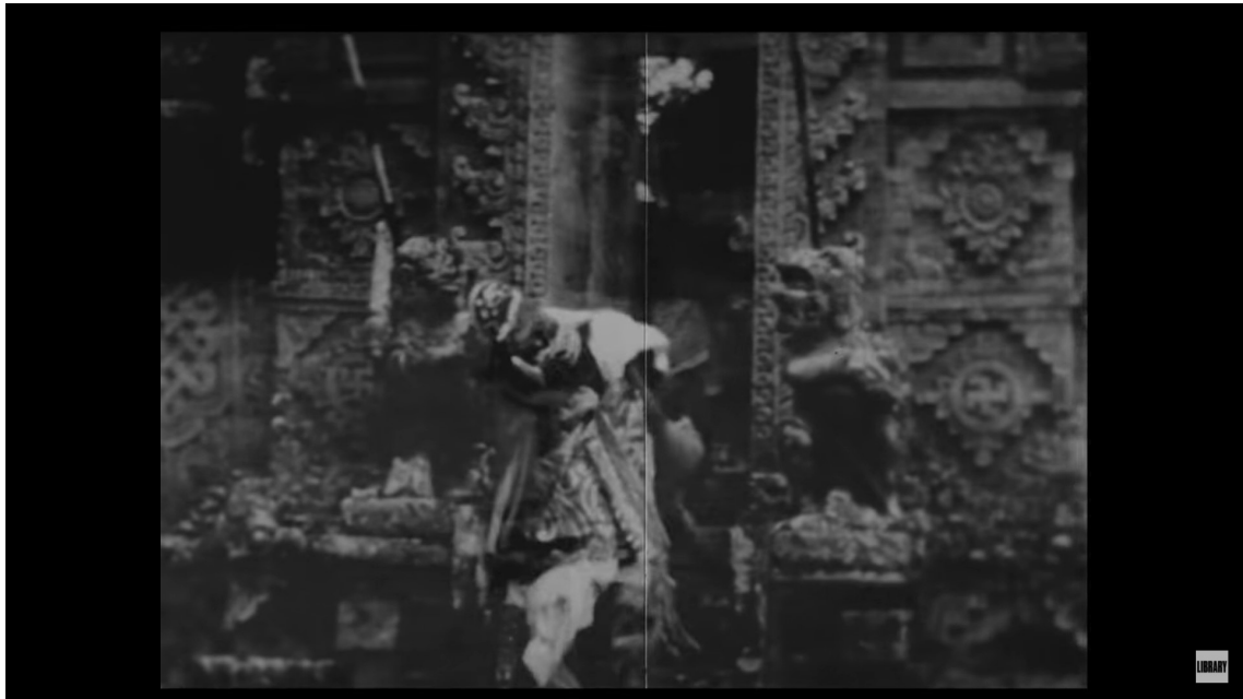
Figure 3: The Pandung attacking Rangda. 35

Rangda reaches the middle of the stage. The cycle in one gongan should end on note dong . 32 According to the Hindu religious concept in Bali, the note dong is the note related to the god Dewa Siwa (Bandem 1986, p 33). Dewi Durga, who is Dewa Siwa's sakti , 33 manifests her power as Rangda. 34 Given these considerations, a more appropriate choice for the soundtrack at this point would have been gending Malpal from Tunjang Durga , rather than Calonarang Tunjang (Figure 4).