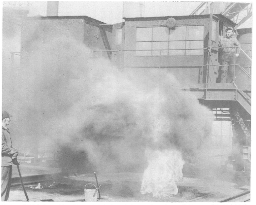
Photograph 2 : Coke Ovens. 'You got to open the hole when ... the larry car charges the oven. Got to sweep all the debris into the hold. That's when they make that big puff! Then you have to get the cover back on. They had a little bucket of mud, you just poured it around to seal the hole.'