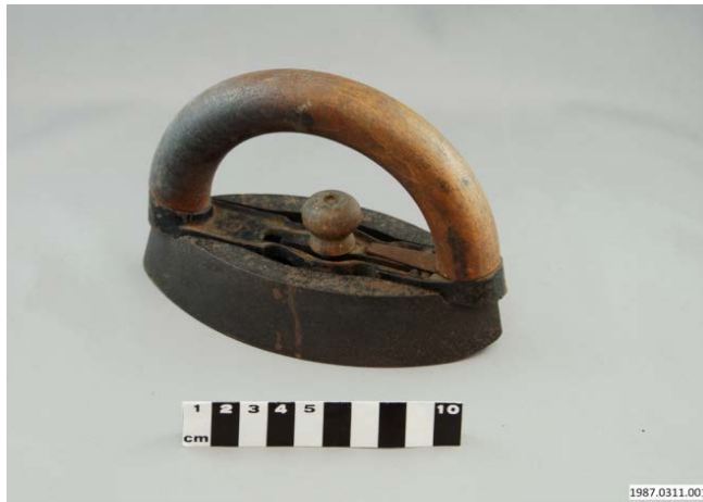
Figure 3. James Smart Manufacturing Company 1880 Black Painted Iron

artifact no.1987.0311.001