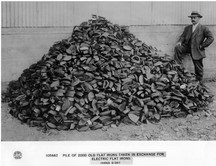
Figure 6: To promote the use of electricity, the General Electric Company gave away 2,000 electric irons in exchange for sad irons.