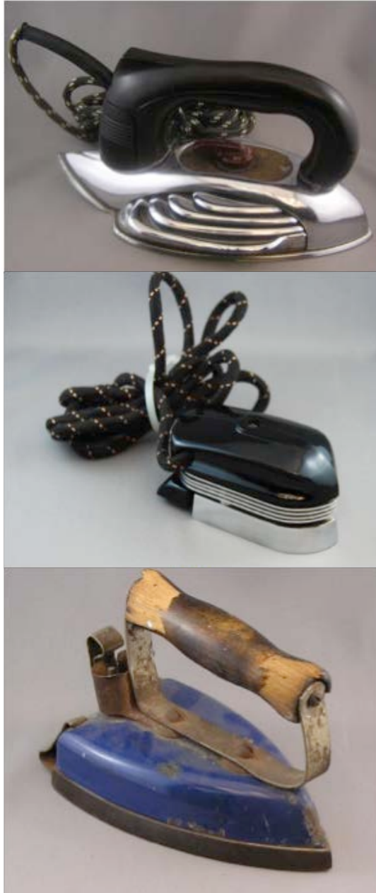
Figure 1. Waverly Tool Company's 1941 Petitpoint W410, Vancouver Engineering Works Limited's 1945 Nepro Midget 33, and Renfrew Electric Products Limited's 1925 Majestic Por-cel-iron 88

Source: CSTMC, artifact no. 1996.0035, 1988.0433, and 1992.0342