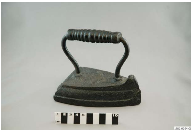
Figure 2. Unknown Manufacturer 1894 G Iron