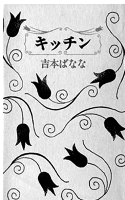
Figure 1 Original (1988)

The original Japanese version has a cover jacket with black tulips on a white background (see Figure 1). On the frontispiece, there are white tulips contrasted against a black background. Although rather ambiguous in its design, a reviewer on the Amazon.co.jp website considered the cover to be a powerful representation of life and death (Bohemiya, 2004, n.p.).