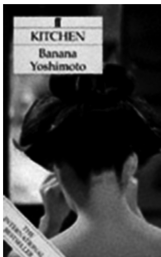
Figure 3: UK Edition (1) Hardcover / Paperback (Faber and Faber, 1993)