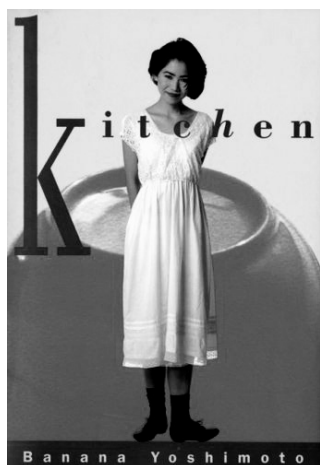
Figure 2: American Edition (Grove Press, 1993)

The publisher uses the same image as the film version for the paperback design in 2006 and the consistency of the visual image indicates that this strategy contributed to the strong sales in the US. In fact, the editor of this translation, Jim Moser of Grove Press, was very pleased with the sales (Harker, 1999, p. 42 n. 3).