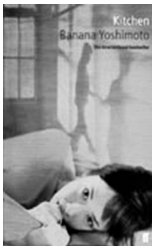
Figure 4: UK Edition (2) Paperback (Faber and Faber, 1999)