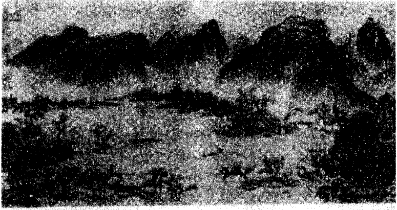
秋江平远图局部 黄筌画 台北故宫博物院藏

From Tang Song Yuan Ming Minghua Daguan .