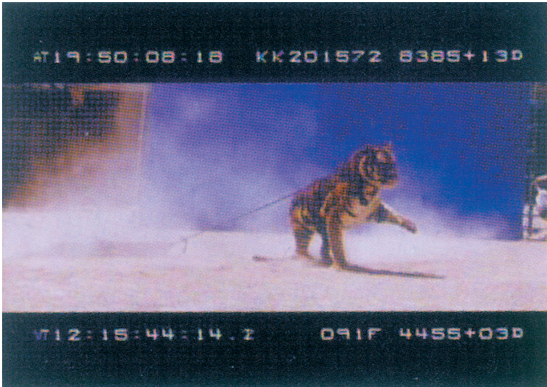
Figure 1. Tiger with blue screen