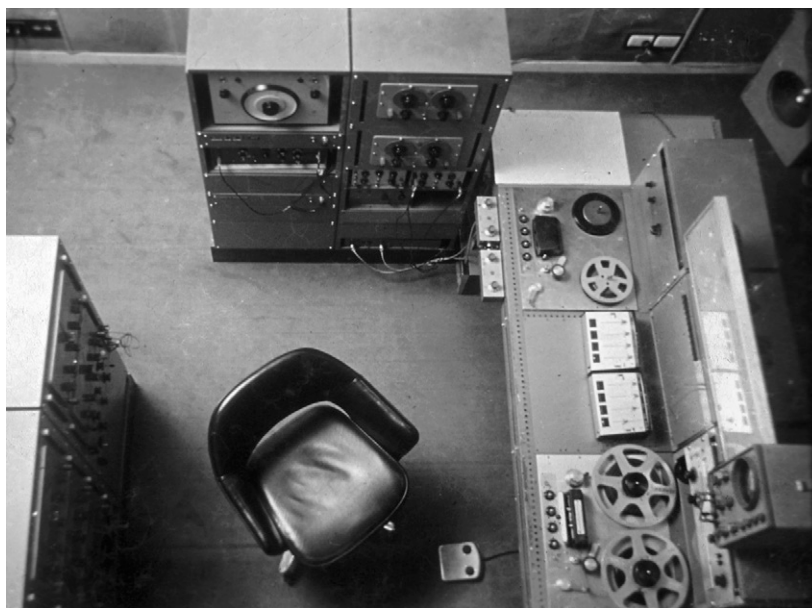
CLAEM – Instituto Torcuato Di Tella, Buenos Aires, Argentine, 1966. The CLAEM's lab was renovated in 1966, following a project by its new technical director, Fernando von Reichenbach (Collection de musique électroacoustique latino-américaine, Fondation Daniel Langlois).

< http://www.fondation-langlois.org/flash/e/index.php?NumPage=545 > [the old laboratory] and < http://www.fondation-langlois.org/flash/e/index.php?NumPage=549 > [the new laboratory]