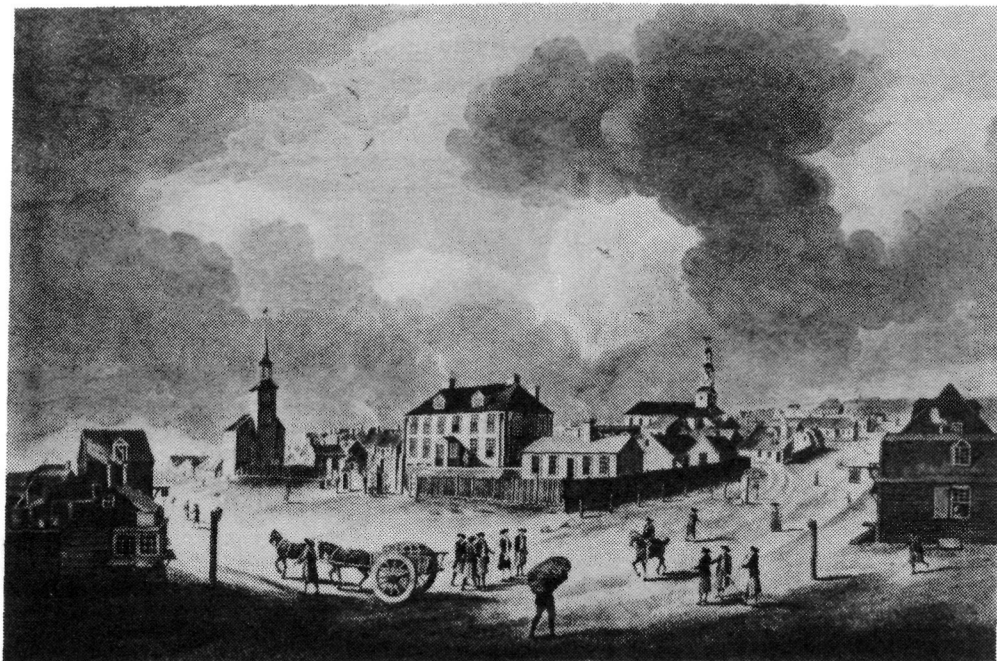
Figure 2 "Governor's house and St. Mather's meeting house at Halifax—1759." Painted by Serres from drawing by R. Short; published by John Boydell, London, 1777.