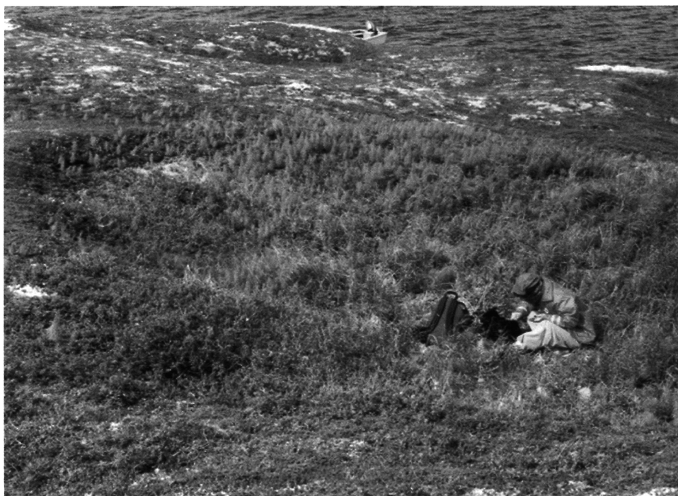
Figure 5. Example of sod house, North Island, Dead Islands Bay (FeAx-3), looking northwest.