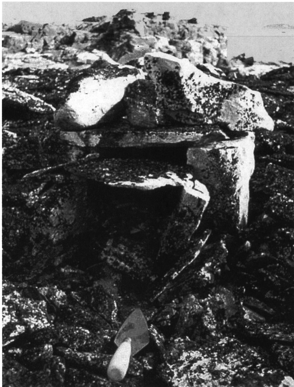
Figure 4. Stone fox trap, Hare Islands, Sandwich Bay (FkBe-8). N-S length: 1 m., width: 60 cm. Trowel to North.