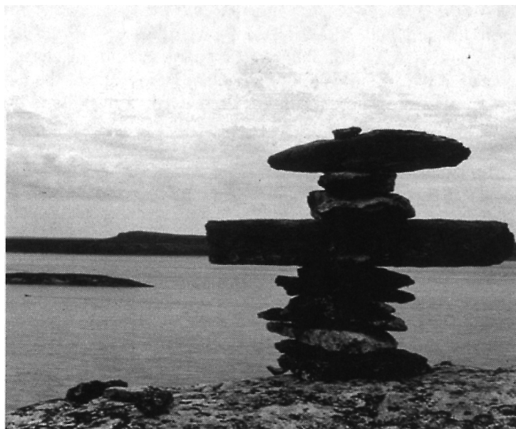
Figure 1. Large Inuksuk on Baffin Island, Nunavut, c. 1970.