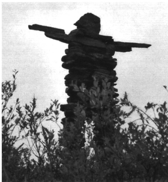
Figure 8. Innunguait "a likeness of a human" greets people as an entry sign to the Inuit town of Kuujuaq, Nunavik. Photo by the author, 2000.