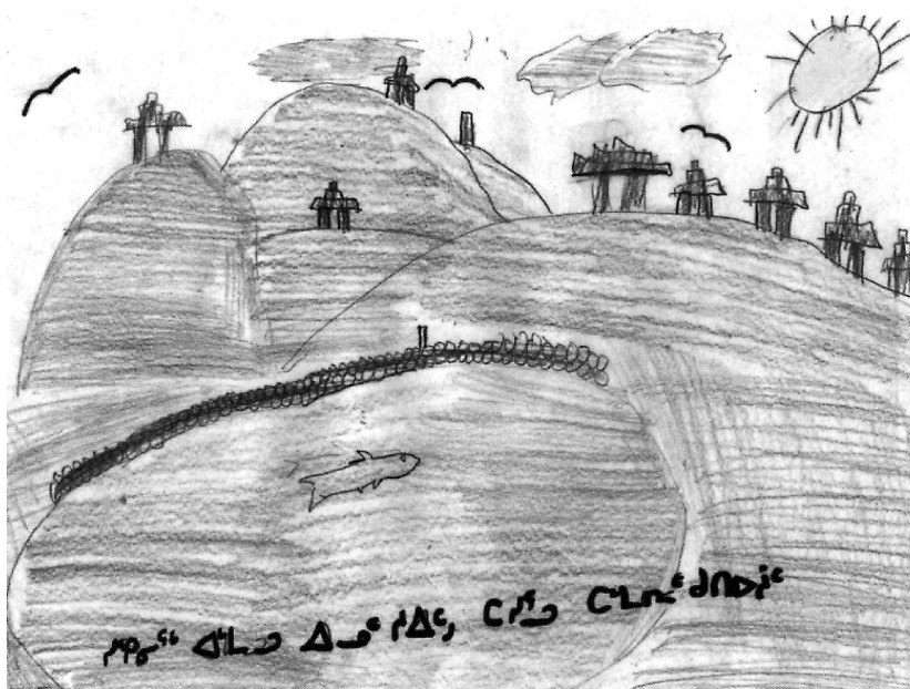
Figure 4. Niungvaliruluit inuksuit mark a navigation route across the landscape. Drawn by anonymous Isummasaqvik School student, Quaqtan, March 1999.