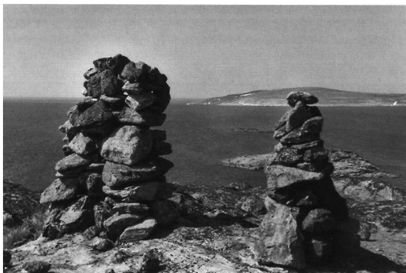
Figure 2. Inuksuit on ridge top near the Inuit village Quaqtuq, Nunavut, 2000. Described to author by Inuit elder David Okpik as indicating a safe place to make camp.