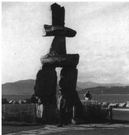
Figure 7. Inuksuk as a tourist attraction along a section of Stanley Park, Vancouver. Photo by the author, 2001.