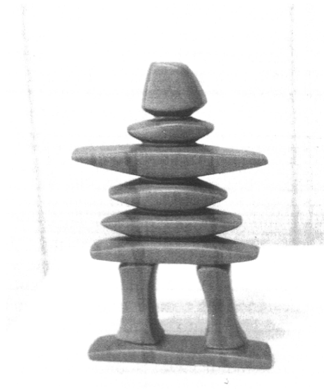
Figure 2. One piece inuksuk model.