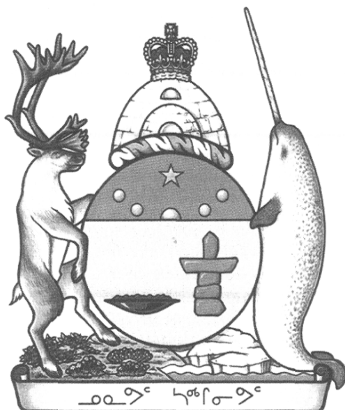
Figure 4. Nunavut's coat of arms.