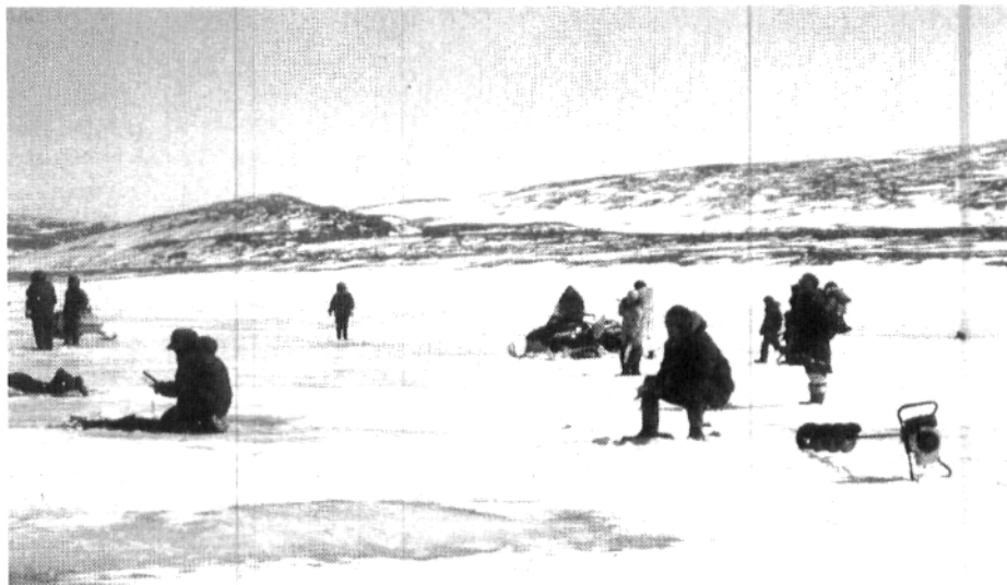
Figure 2. Fishing, Southampton Is., Nunavut, 2000.