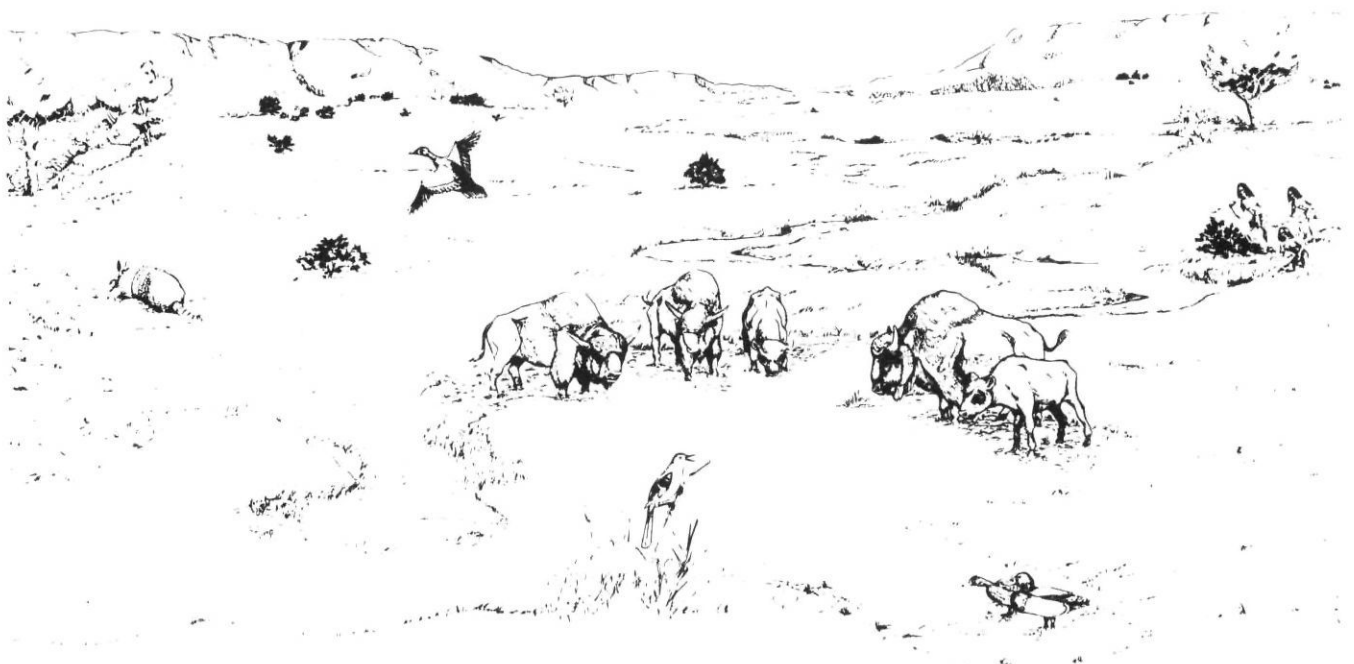
FIGURE 4. Artist's drawing of the paleoenvironments and fauna of the Southern High Plains draws during Folsom through Plainview times (11,000-10,000 yr BP).

Dessin du paléomilieu et de la faune qui existaient à l'époque de Folsom jusqu'à celle de Plainview (11 000 à 10 000 BP) dans les hautes plaines du Sud.