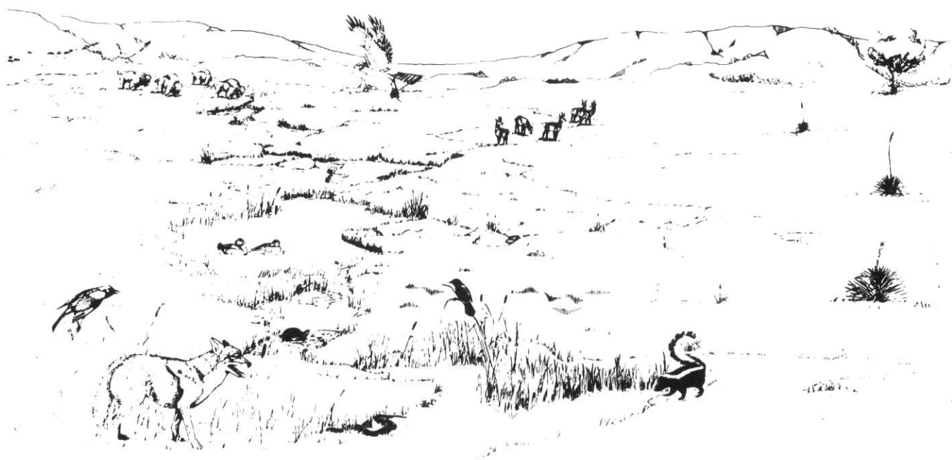
FIGURE 5. Artist's drawing of the paleoenvironments and fauna of the Southern High Plains draws during Firstview times (8600 yr BP).

Dessin du paléomilieu et de la faune qui existaient à l'époque de Firstview (8600 BP) dans les hautes plaines du Sud.