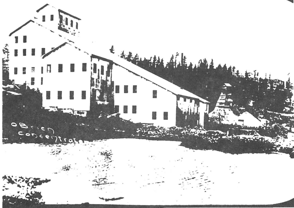
The O'Brien Concentrating Mill; old shaft house in the background.