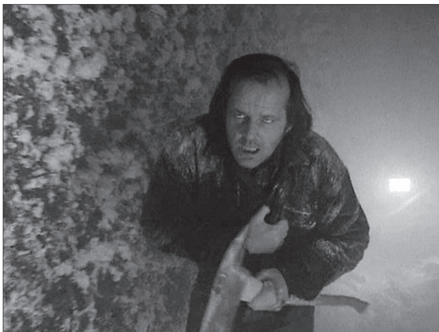
Fig. 3. Real actor, fake maze: Jack Nicholson in The Shining (Stanley Kubrick, 1980).