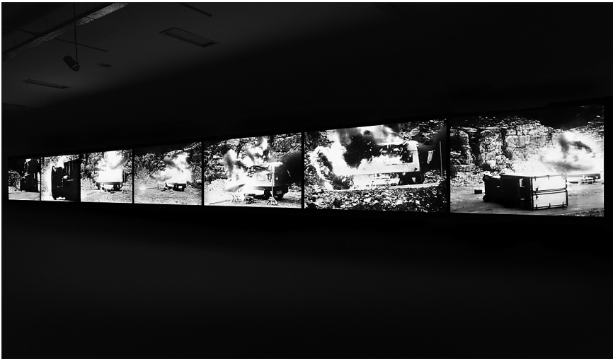
Fig. 1: Seven minutes before , 2004.

Melik Ohanian, Seven minutes before , 2004, 7 synchronized video projections, Beta Digital on DVD with DTS Sound, 28 speakers and 7 bass boxes, 7 × 21 min. 2800 × 1200 cm. Courtesy of the artist, KRISTALE Company, and Galerie Chantal Crousel, Paris.