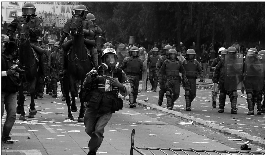
Fig. 3: Melik Ohanian, September 11, 1973 _ Santiago, Chile , 2007, HD video on DVD with ambient sound, 90 min.