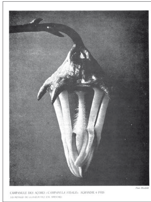
Fig. 5: Karl Blossfeldt, Campanula Vidalii six-times enlarged. Picture-page accompanying Georges Bataille's article "Le langage des fleurs", Documents 1/3, 1929, p.161.

followed Carl Einstein's article on Braque. The toes, enlarged to cover a full page, jump out aggressively from the black background. 22