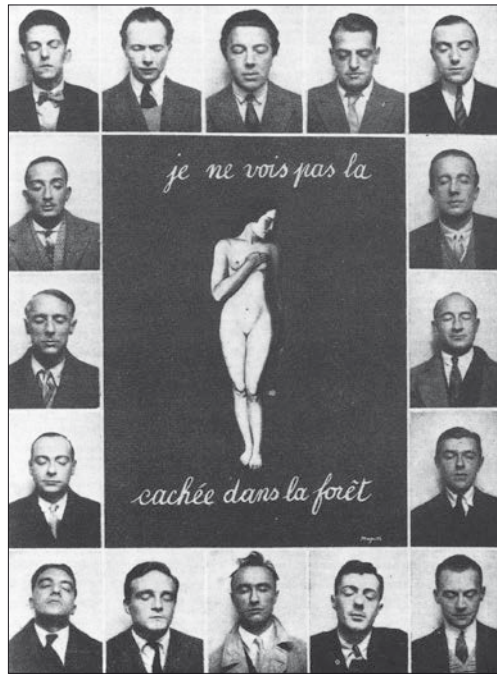
Fig. 3: Photomaton pictures of Breton's group around a painting by René Magritte, La révolution surréaliste 5/12, 1928, p. 73.

This is an ingenious example of picture policy, for not only is the dynamics between picture and text an attack on naïve humanism, but also simultaneously ridicules the self-promoting Surrealist circle surrounding Breton (which Bataille, Leiris, and several others from the Documents staff had left). Furthermore it mocks the Breton's relationship to the 19 th century and the dream. No names, no arguments, but simply a gesture of contempt, completely uninvolved: this is the strategy of this piece of picture policy. It conforms to the policy from issue to issue for a more assured concept of the journal. Documents infiltrates, experiments, and goes straight to the point.