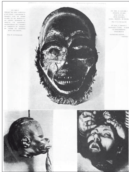
Fig. 1: Ethnographic photographs and a detail from Cranach's Judith and Holofernes . Picture-pages illustrating the article by Ralph von Königswald "Têtes et crânes", Documents II/6, 1930, p. 356.

Rather, it is a strategy of subversion. The manner in which objects confront one another is not based on some incantation of magical connections nor determined by trans-cultural values. It aims at démontage . Without polemics enmeshed in daily ideological debates, bourgeois certainties and ideals are exposed to attack. The choice of themes is made with an anthropological view devoid of humanistic disguises.