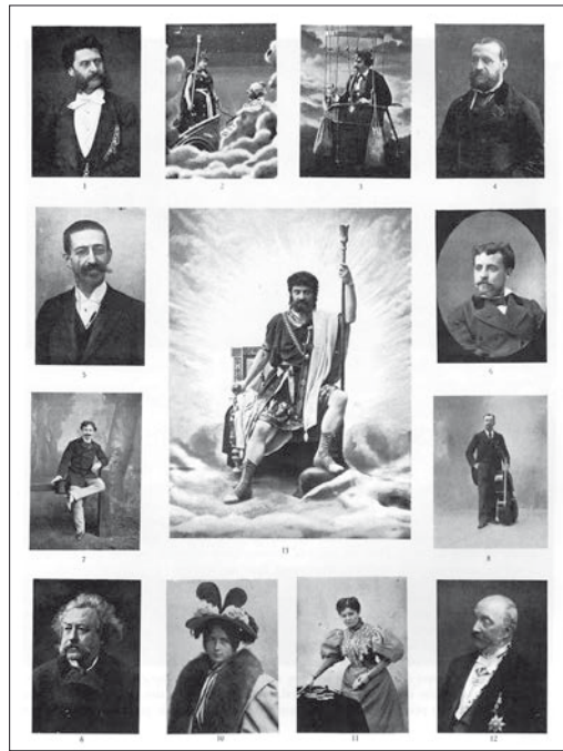
Fig. 2: Photographs by Nadar. Picture-page illustrating Georges Bataille's article "Figure humaine", Documents I/4, 1929, p. 201.

photo to scorn and ridicule, it also affects those that follow, which are compiled and arranged accordingly. The grouping of formerly renowned actors with a Jupiter figure in the middle appears ridiculous (fig. 2). Nadar, who had photographed the dandified protagonists, seems to be scaled down to the level of a commercial photographer immortalizing the vanity of the subjects photographed. But that is not all. With this composition, the surrealists surrounding Breton were also attacked: the informed observer recognizes the template of the photo page with which Breton's group staged their program for La révolution surréaliste . Georges Didi-Huberman confronted the image with its missing counterpart on the double page (fig. 3). 15