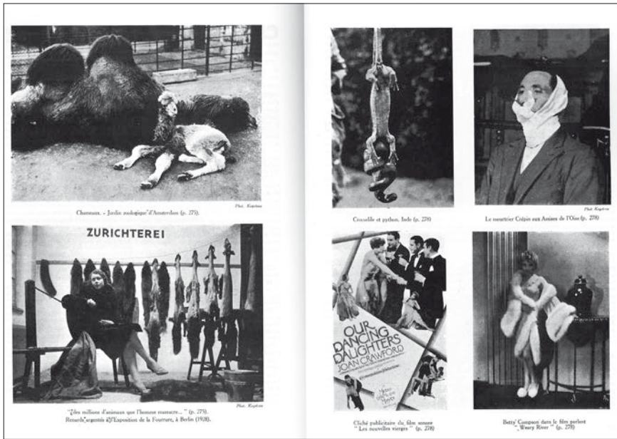
Fig. 4: Camels in the Zoo (Foto Keys tone); promotional pictures for a Fur Trade Fair in Berlin 1928 (Foto Keystone); Crocodile and Python, India; The Murderer Crepin (Foto Keystone); promotional pictures for the Talkies Our Dancing Daughters and Weary River . Picture-pages in Chronique-Dictionnaire, Documents 1/5, 1929, p. 276-277.

the clothesline behind her. Although the crocodile, already half-devoured by a python, seems to be a contrasting image of the cruelty of animals, it is in fact also the result of human action: the frame of the picture is set in such a way that one cannot see the hand that playfully holds the crocodile up to the python. Leiris unites perpetrator and victim in the rubric "Reptiles" and, from a few ethnographic suggestions, constructs a pseudo-symbolic meaning where the reptiles appear as an accurate depiction of human existence, "traversée du haut en bas par la mort et l'amour". 17 It reads like a parody of the surrealist iconography of the praying mantis, so extremely fascinating because of the simultaneity of mating and death. 18