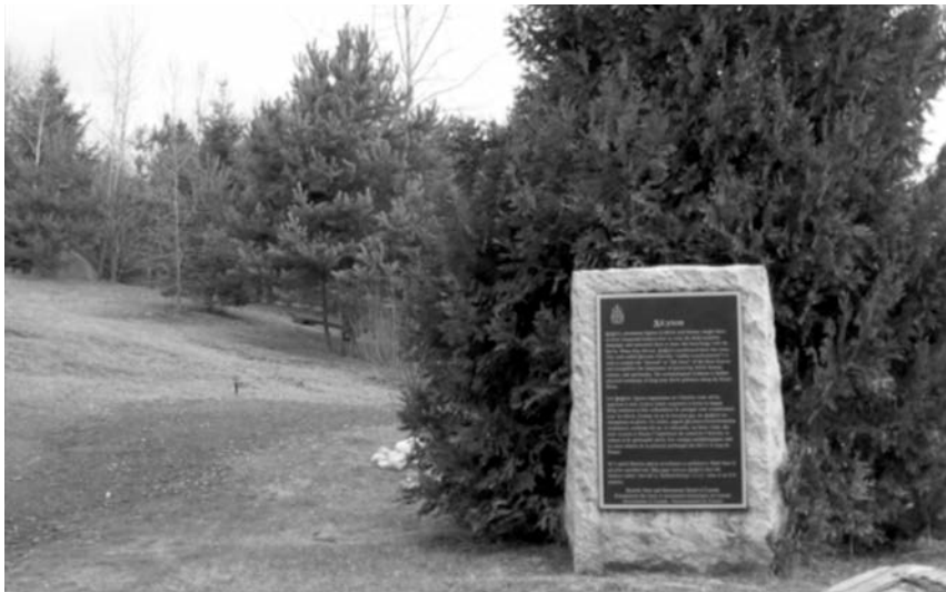
Figure 2. Parks Canada plaque at Xá:ytem. The sxwóxwiyám is presented first in English, then French, and lastly in Halq'eméylem.