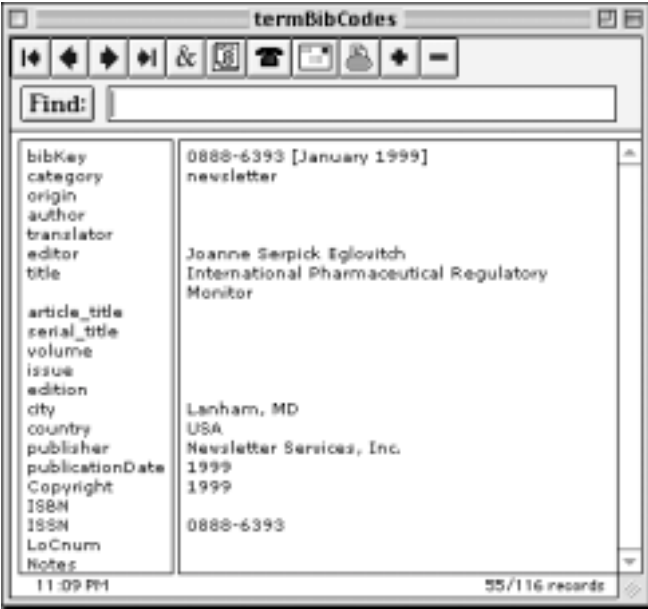
Figure 3. A Sample Bibliographic Entry

The above data fields are modeled on the ISO 12620 data categories as shown below (author’s comments appear in italic ).