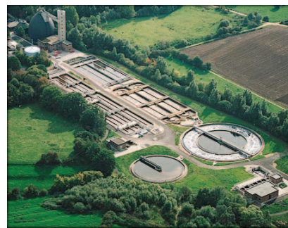
Figure 2. Two different images to illustrate the concept “water pollution”.

In the context of text analysis prior to translation, it is therefore important to include image analysis as an important issue regarding the adequacy of an image in terms of catalyser of the function and focus of a particular text. Furthermore, as the eye meets the visual information before the textual one, processing information through graphic input might well condition the later understanding of the information contained in the text. As Lee-Jahnke (2005: 363) puts it for the case of mental representations: