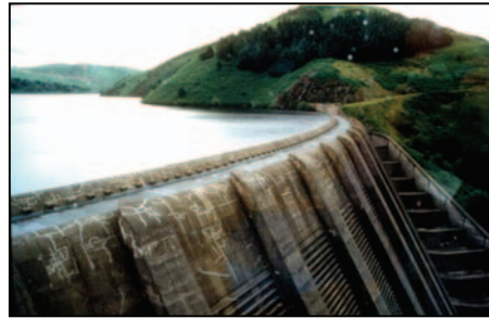
Figure 1. Examples of an inadequate image to illustrate a concept (left) and an adequate one (right) on the grounds of prototypicality.