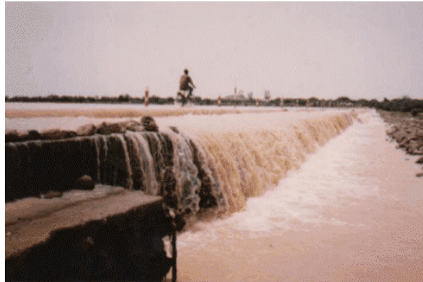
Figure 4. Image extracted from the Puertoterm image bank to illustrate the “concept flood”.

Since there is evidence that situated simulation (Barsalou 2003) is a powerful interface between perception and cognition, we believe that just as the development of process-oriented terminology banks (Faber et al, in this volume) should include contextually-relevant properties of the focal category, the image should also bear a close relation to the focal categories. For example, when searching for the lexical item flood in our corpus, the word is usually accompanied by information regarding the consequences of floods for human populations. It is quite likely that the images accompanying these texts use human features to illustrate the concept, such as those in figure 4.