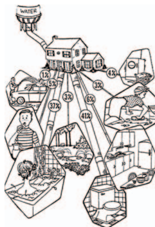
Figure 5. Image used to illustrate the concept water demand

There are many instances in which scientific images can pose an ideological bias. The following image inaccurately illustrates the concept water demand . The presence of an image transmitting sexual stereotypes might suggest the need to search for further bias in the textual frame.