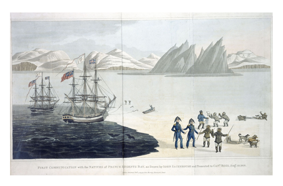
Figure 1. "First Communication with the Natives of Prince Regent's Bay" from John Ross, 1819, A Voyage of Discovery ... enquiring into the possibility of a North-West Passage.

Source: The British Library Board. BL Shelfmark: G.7399.