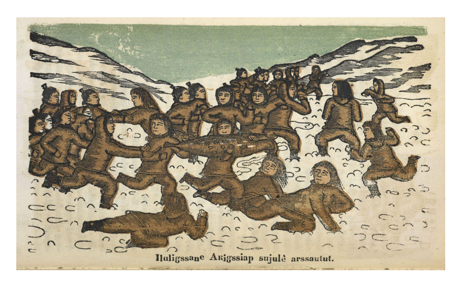
Figure 2. A print by Aron Kangek from Kaladlit Okalluktualliait (Greenland Legends), 1859 and 1863.