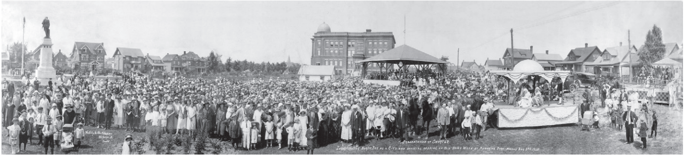
FIGURE 3: Panoramic view of the crowd gathered at Memorial Park for the presentation of the city's charter to Mayor MacDonald by the minister of mines, Charles McCrea, and the official opening of Old Home Week, at noon, 3 August 1925.