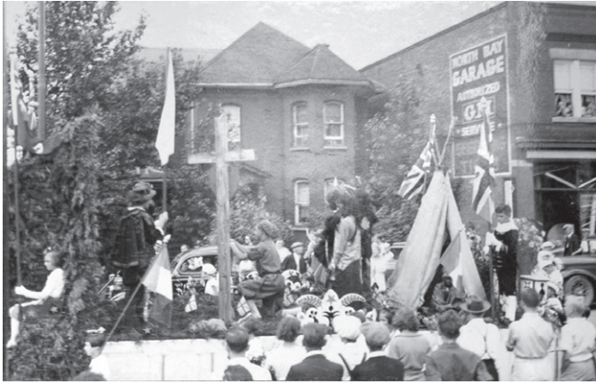
FIGURE 4: Le Cercle canadien français's Jacques Cartier Float in the 1935 Old Home Week celebrations.