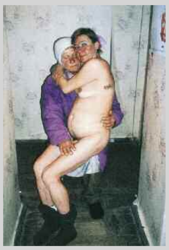
Case History series, 1997–98, a set of 400 photographs, variable dimensions, courtesy of the Saatchi Gallery, London

the images possess a strong performative or narrative sense, perhaps due in part to the fact that the subjects were paid to participate in the project; most of them stare directly into the camera, engaging directly with the viewer while exposing not only their living conditions, but also, in many cases, their bodies in various states of undress. Like players in a sideshow, they invite viewers to peer into the underside of society from a safe distance and without fear of getting their hands dirty.