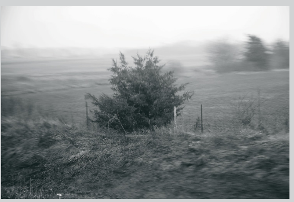
Untitled Photographic Pictures, 2015 inkjet print, 152\times229~\text{cm}

In this series of photographs, Wright opens up a rich interpretive space by taking the motif of the empty landscape