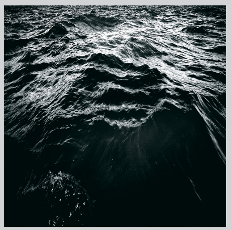
Abysse 2, from the series PEQUOD ('pi:'kwad), 2015, inkjet print on Barite paper, 102 × 81 cm

Lefort's images seem to have been shot at the helm of a wave-drenched binnacle, with compass and octant close at hand, and all is in a state of irredeemable flux, as the ship pitches and rolls on the face of the deep and fateful cusp of jeopardy that is the open sea. The fact that he is in a kayak and not at the helm of a large sailing ship is not immediately apparent. There seems