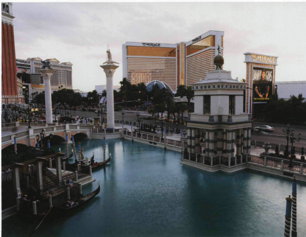
Inca Trail, Peru, 2005 101,6 x 132,1 cm