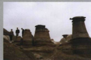
Roger Minick Viewing Day at Crazy Horse, 1999 , C-print 40,6 x 48,3 cm, Courtesy of the Jan Kesner Gallery, Los Angeles