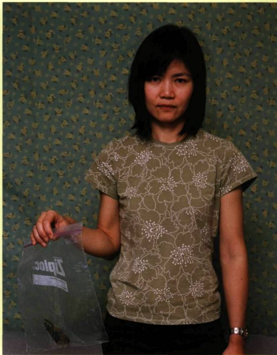
The Centre of the Forest Is a Lake Like Mirror Series of 48 photographs 40 x 32 cm, 32 x 40 cm, 30 x 24 cm and 40 x 40 cm Inkjet prints on paper 2004–2005