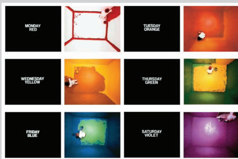
John Baldessari, Six Colorful Inside Jobs, 1977, video stills, 16 mm color film transferred to video, 32 min. and 53 sec., courtesy of the Marian Goodman Gallery, New York and Paris