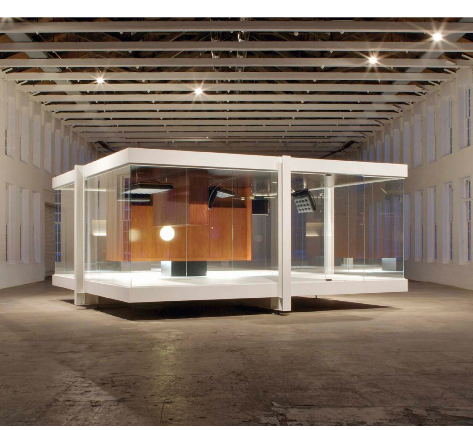
Iñigo Manglano-Ovalle, Gravity Is a Force to be Reckoned With, 2009. Steel, glass, wood, mixed media, 7.2 x 7.2 x 4 m. Installation view at MASS MoCA, North Adams, MA.