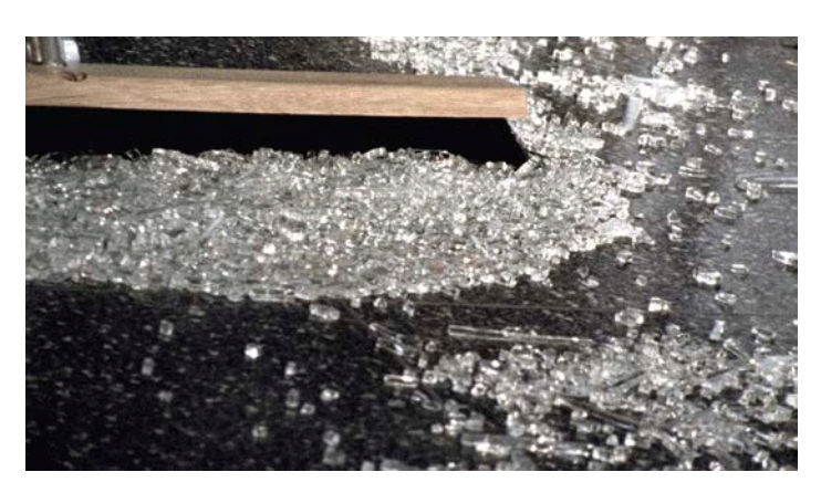
Iñigo Manglano-Ovalle, Always After (The Glass House), 2006. Super 16mm film transferred to high definition digital video, 9:41 continuous loop.

is emphasized rather than transience, robustness rather than fragility, qualities that resonate with the potential recurrence of ideological modernist beliefs, and the protests against them. As feared by the residents of the masterpiece glass houses and by Zamyatin's I-330, transparency becomes violent particularly when it encases where our life takes place, but their cautionary tales contrast well with the unflagging construction of new glass complexes and office buildings. We wish glass to be transparent; we will keep wishing it. The shadow of clear glass resides in the persistence of our desire for transparency, while attending to its presence is perhaps as difficult as letting our eyes dwell on a window surface destined to be overlooked for the sake of what lies behind the pane.