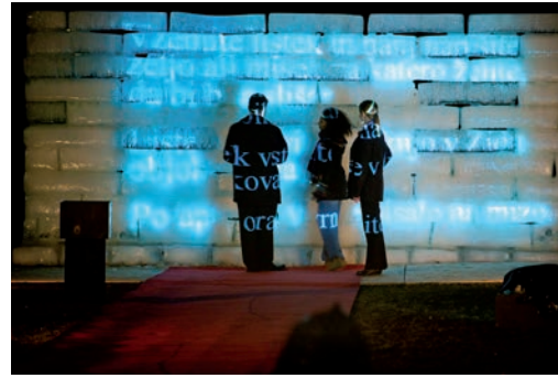
JANEZ JANŠA, THE WAITING WALL, NOVO MESTO, SLOVENIA, 2011.