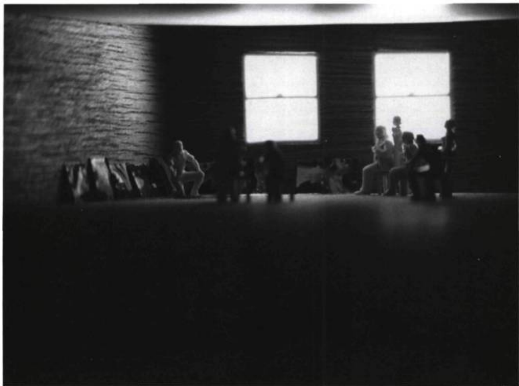
Paul Hunter, Discussion dans l'atelier , 1985. Wood, plastic, paper, acrylic; 5 x 29 x 59 cm.