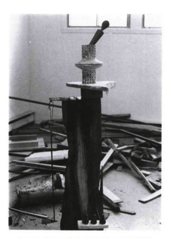
Serge Murphy, Sans titre (environment component), 1988, Mixed media; 110 x 40 x 30 cm. (sight).

treatment technique (lamellage) Sauvé floated a crosssection model of a mutant seed (its plumule inverted so that growth was turned back into the embryonic centre) on wooden stylized gusting wind and tossing wave. In the companion piece a debris-scattered sheet of water swept over a bundle of saplings brought to ground. Cellular miscombination or environmental mismatch signaled eminent early demise.