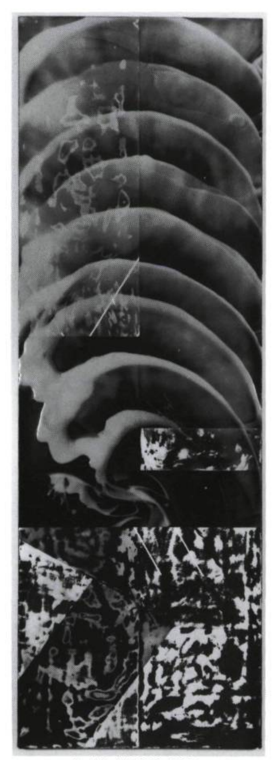
David Reed, No 202-2, 1982-86. Oil on canvas with alkyd; 9 x 3 ft.

D.R. : Yes. As a student and after, I was completely happy struggling with painting. It challenged me in every way : physically, intellectually and emotionally. Perhaps more than most I tend to separate emotion and intellect; painting seemed a way of combining them. I