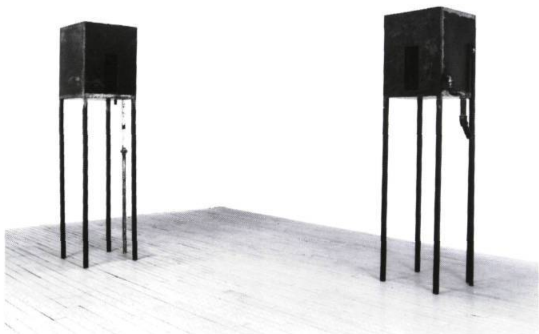
Betty Goodwin, Room , 1988. Steel, pastel and wax on metal; 169 x 47,5 x 40,5 cm (left); 169 x 54 x 40,5 cm, (right).

Betty Goodwin, galerie René Blouin, March 25 to April 22, 1989 —