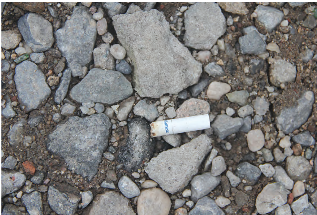
Heather Dewey-Hagborg, Sample 6-0, Stranger Visions , 2013.