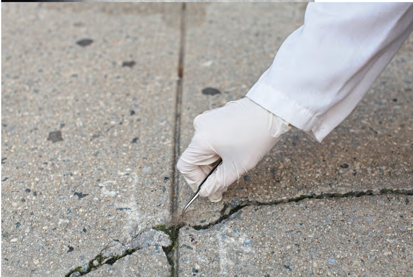
Heather Dewey-Hagborg, Hair Collection , Stranger Visions , 2013.