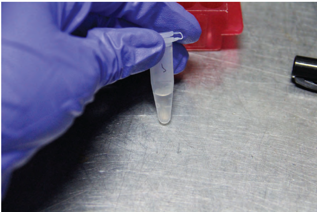
Heather Dewey-Hagborg, Genspace (DNA laboratory), Stranger Visions , 2013.