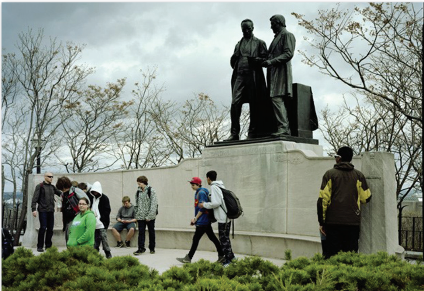
Baldwin-LaFontaine Monument Parliament Hill.