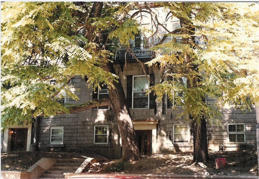
The LaFontaine House in 1987.

However, these agreements were broken by the owners of the site, who slowly, illegally demolished all but the LaFontaine House. It's interior, however, was unofficially allowed to be demolished as well. The obvious intention of this was that it would fall down by itself. For the next twenty-five years from 1990, various efforts by conservationists and activists also failed to move any government or administration to acquire the building. In 2014, the whole block was sold to Asiatic developers and a comprehensive plan was presented to have the federal government acquire the house as a condo on the site, rather than as a house on a subdivided lot, separate from the very large, very expensive whole block.